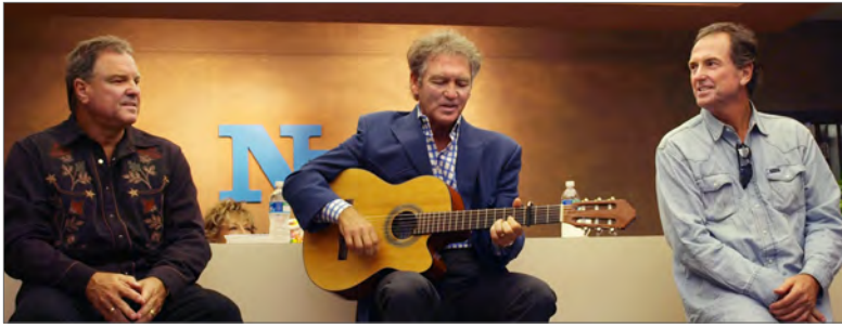
Larry Gatlin and the Gatlin Brothers stopped by NPT to discuss their new project, Pilgrimage.