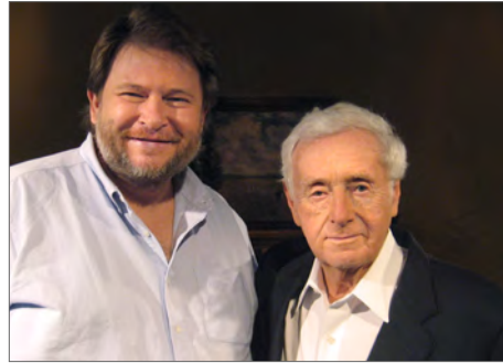
Rick Bragg, left, joined John Seigenthaler on A Word on Words .

ued to grow, so this year we provided several segments on the topic, including leaf composting at Vanderbilt University and a showcase on organic ways to cure gardening woes, highlighting organic gardening fertilizers, pesticides and fungicides. Highlights of the season included a golf course