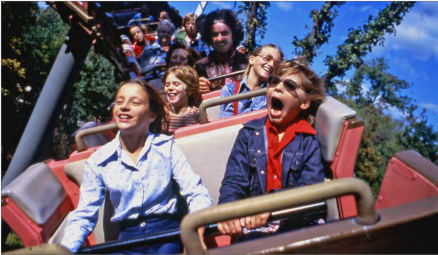
Memories of Opryland