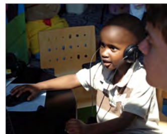
Children learned how to use the PBS Island web site at the launch of our PBS Kids Raising Readers Library Corner at Edmonson Pike Branch of the Nashville Public Library.