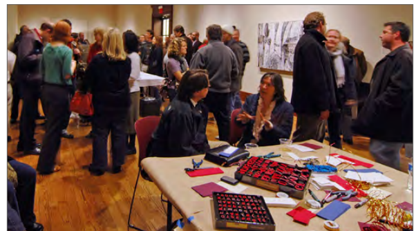
Documentary and typography fans gathered at the downtown Library in December for a Community Cinema screening of Gary Hustwit's film Helvetica .

NPT is taking advantage of the many social networking tools available to us on the web, with a YouTube channel for NPT videos at youtube.com/wnptvideos , a Facebook page at facebook.com/nashvillepublictelevision and a Twitter feed @npt8. Our NPT Media Update Blog at npt08.wordpress.com now draws close to 7,000 views per month.